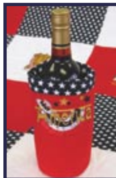
Wine or Water Bottle Cooler