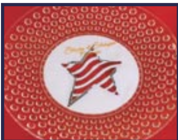
Festive Holiday Plates