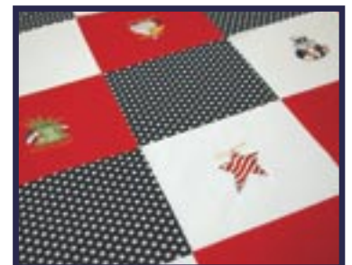
American Pride Picnic Tablecloth