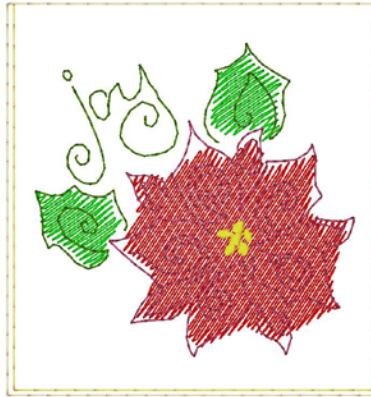
Example of front pocket piece