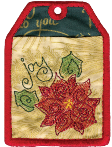
Finished Gift Card Holder