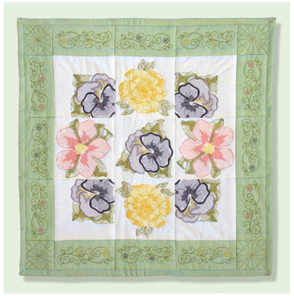
Legal Notice: Making a copy, by any means, of Dakota Collectibles' artwork or design software is a violation of copyright law. The design software is licensed to the original customer for embroidery use at one location. ©2010 Dakota Collectibles. All Rights Reserved.

Create your own wall hanging or use our sample below as your guide for number of quilt squares needed.