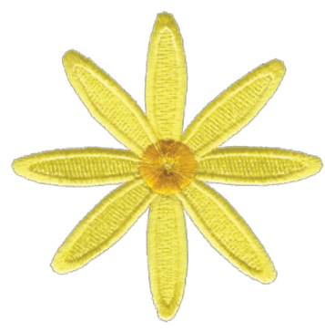
ASTER PETALS (TOP &MIDDLE)

ASTER PETALS File: FL1593 3.44"W X 3.44"H ST: 8,024 Colors: 2 1. Yellow2 2. Dk. Dk. Yellow