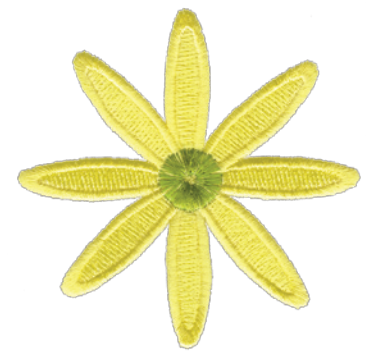
ASTER PETALS (BOTTOM)

File: FL1594 3.44"W X 3.44"H ST: 8,024 Colors: 2