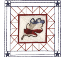
LEAF QUILT SQUARE* (Some Areas Light Fill) 5. Lt. Blue Gray File: KC0077 (C) 6. Dk. Blue Gray 3.50"W X 3.50"H 7. Cream ST: 7,157 8. White Colors: 13 9. Lt. Taupe 1. Cream 10. Red 2. Red 11. Lt. Red 3. Dk. Blue Gray 12. Dk. Red 4. Blue Gray 13. Dk. Brown