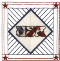
U. S. A. QUILT SQUARE* 4. Blue Gray (Some Areas Light Fill) 5. Dk. Blue Gray File: KC0078 (C) 6. Cream 3.50"W X 3.50"H 7. White ST: 8,419 8. Lt. Taupe Colors: 12 9. Red 1. Cream 10. Lt. Red 2. Dk. Blue Gray 11. Dk. Red 3. Red 12. Dk. Brown