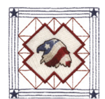
EAGLE QUILT SQUARE* (Some Areas Light Fill) 5. Lt. Blue Gray File: KC0081 (C) 6. Dk. Blue Gray 3.50"W X 3.50"H 7. Cream ST: 7,739 8. Lt. Taupe Colors: 13 9. White 1. Cream 10. Red 2. Red 11. Lt. Red 3. Dk. Blue Gray 12. Dk. Red 4. Blue Gray 13. Dk. Brown