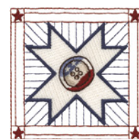
BUTTON QUILT SQUARE* (Some Areas Light Fill) 5. Dk. Blue Gray File: KC0080 (C) 6. Lt. Blue Gray 3.50"W X 3.50"H 7. Cream ST: 7,432 8. Lt. Taupe Colors: 13 9. White 1. Cream 10. Red 2. Dk. Blue Gray 11. Dk. Red 3. Red 12. Lt. Red 4. Blue Gray 13. Dk. Brown