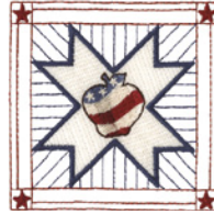
APPLE QUILT SQUARE* (Some Areas Light Fill) 5. Dk. Blue Gray File: KC0075 (C) 6. Lt. Blue Gray 3.50"W X 3.50"H 7. Cream ST: 7,390 8. Lt. Taupe Colors: 13 9. White 1. Cream 10. Red 2. Dk. Blue Gray 11. Lt. Red 3. Red 12. Dk. Red 4. Blue Gray 13. Dk. Brown