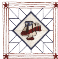
4TH QUILT SQUARE* 3. Red (Some Areas Light Fill) 4. Blue Gray File: KC0079 (C) 5. Dk. Blue Gray 3.50"W X 3.50"H 6. Cream ST: 7,033 7. Lt. Taupe Colors: 10 8. Red 1. Cream 9. Dk. Red 2. Dk. Blue Gray 10. Dk. Brown