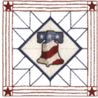
BELL QUILT SQUARE* (Some Areas Light Fill) 5. Lt. Blue Gray File: KC0074 (C) 6. Dk. Blue Gray 3.50"W X 3.50"H 7. Cream ST: 7,075 8. White Colors: 13 9. Lt. Taupe 1. Cream 10. Red 2. Dk. Blue Gray 11. Lt. Red 3. Red 12. Dk. Red 4. Blue Gray 13. Dk. Brown