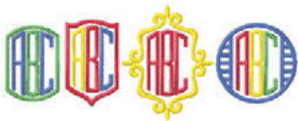
3 LETTER CIRCLE